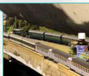
Track Magic leaves no slippery residues and prevents wheel spin on locos hauling heavy trains.