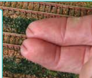
Dirty track... Not good! It needs the Track Magic treatment.