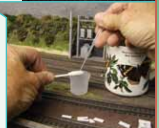
Use the pipette to dispense about a millilitre of Track Magic onto the swab to moisten.

Tip: Keep the bottle in a mug to avoid spillages.