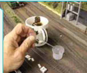
Transfer Track Magic into the beaker.

Tip: Keep the bottle in a mug to avoid spillages.