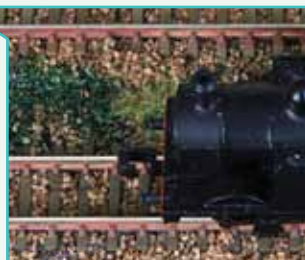
The railhead is now clean.