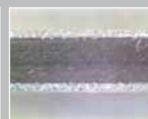
Treated with Track Magic

Anti corrosion test proves effectiveness of Track Magic invisible conductive film after two weeks salt water immersion.