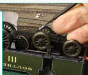
Using the brush with Track Magic to clean loco wheels.