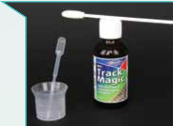
Deluxe Materials Track Magic pack contents: 50ml bottle of Track Magic , beaker, pipette, swab and brush.