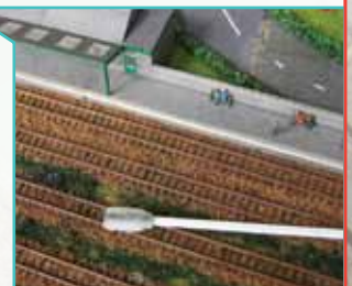
The flexible swab making a simple job of cleaning in confined spaces.