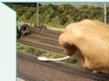
Rub swab lightly along the railhead.