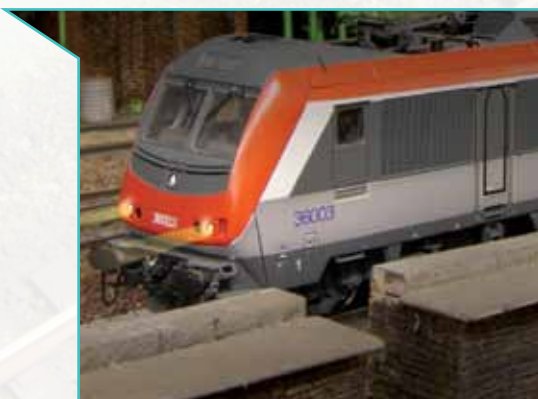
Running lights stay on and without flicker.