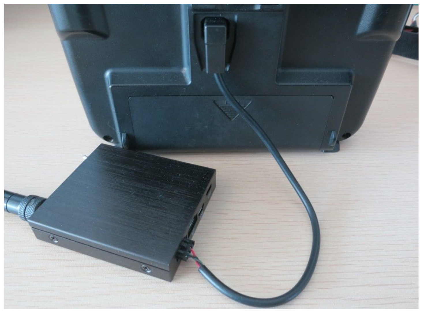
Plug and play cable for Turnigy/Imax/Flysky 9x2, 9XR, frsky Taranis, JR 3801, 9x2 and similar: