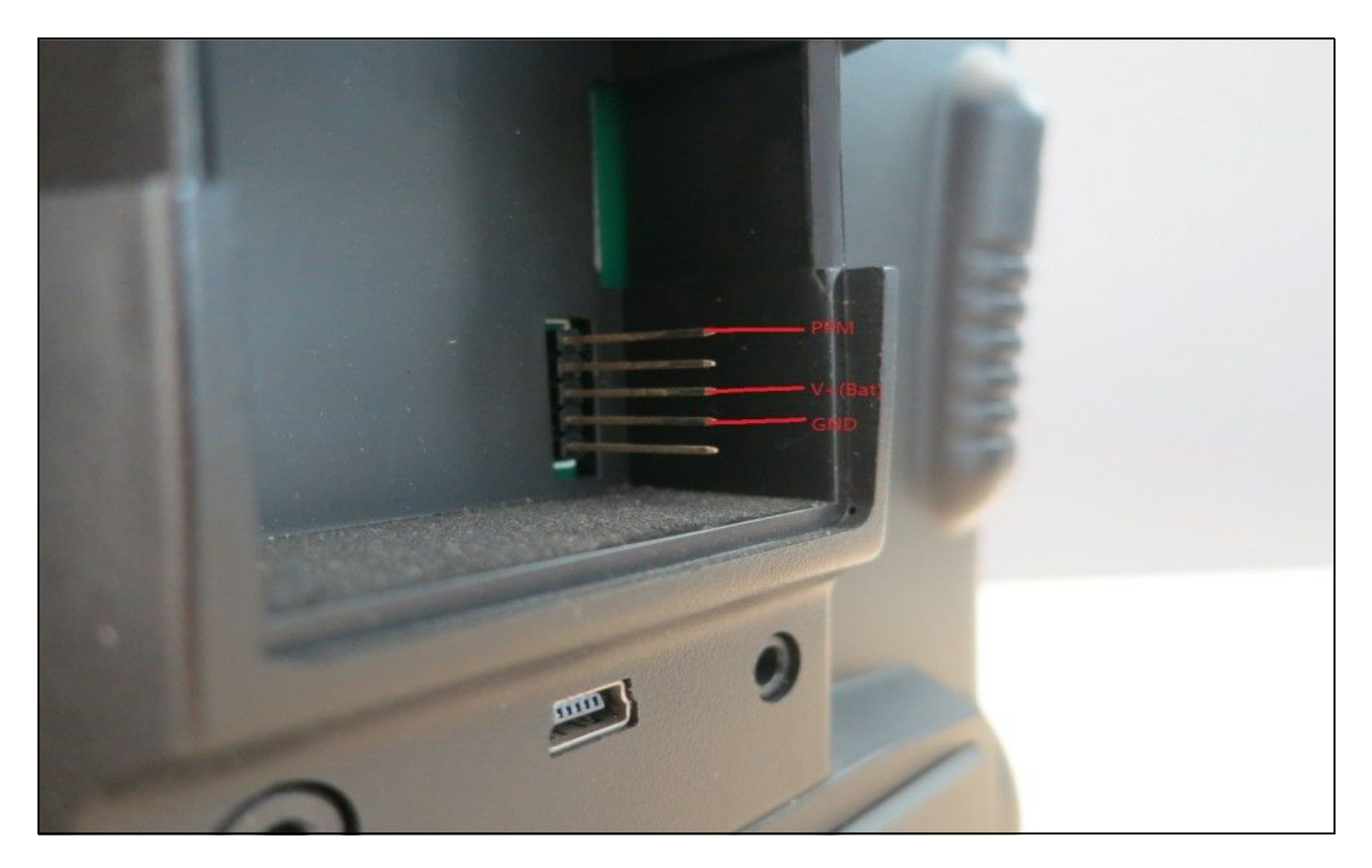
We have shielded cables custom for common radios in the market: Plug and play cable for Futaba radios with square trainer port: