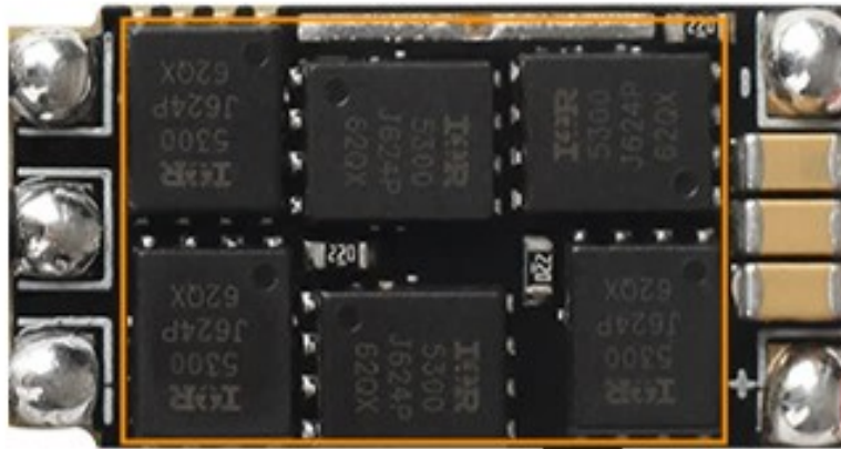
Imported Industrial MOS